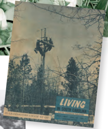
The co-op magazine looks much different today than in 1967. 'My goodness, how things change over time.'

Marlboro Electric is celebrating 70 years of service! Each co-op member registered and present at Marlboro Electric's 70th Annual Meeting will receive a red fold-out stadium chair and two compact fluorescent light (CFL) bulbs. Registered and present members will also be eligible for the Grand Prize, Semi-Grand Prizes and many other prizes. ▶ When: Saturday, April 16 ▶ Where: Marlboro County High School, Fayetteville Avenue, Bennettsville ▶ Time: Registration 12 noon until 2 p.m. Business Meeting begins at 2 p.m. ▶ Grand Prize: 2006 Ford 150 truck ▶ Semi-grand Prizes: Refrigerator, washer and dryer, stove and a television ▶ Entertainment: Melody Aires Gospel Group WIRE-sponsored CONCESSIONS, RAFFLE & BOOTHS HEALTH FAIR by Marlboro Park Hospital BLOOD DRIVE by American Red Cross FACE-PAINTING CLOWNS by Snikkles and Lemonade