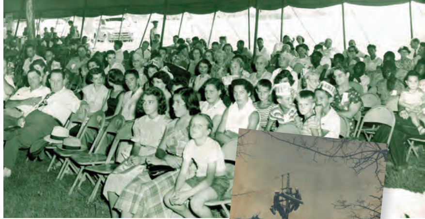
Marlboro Electric's Annual Meetings were held under large tents, 'back-in-the-day'.