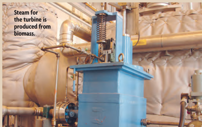
Steam for the turbine is produced from biomass.