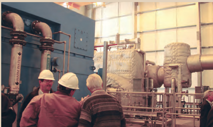
Attendees at the Breaker Throw Ceremony stood back to take a good look at the biomass energy turbine generator.